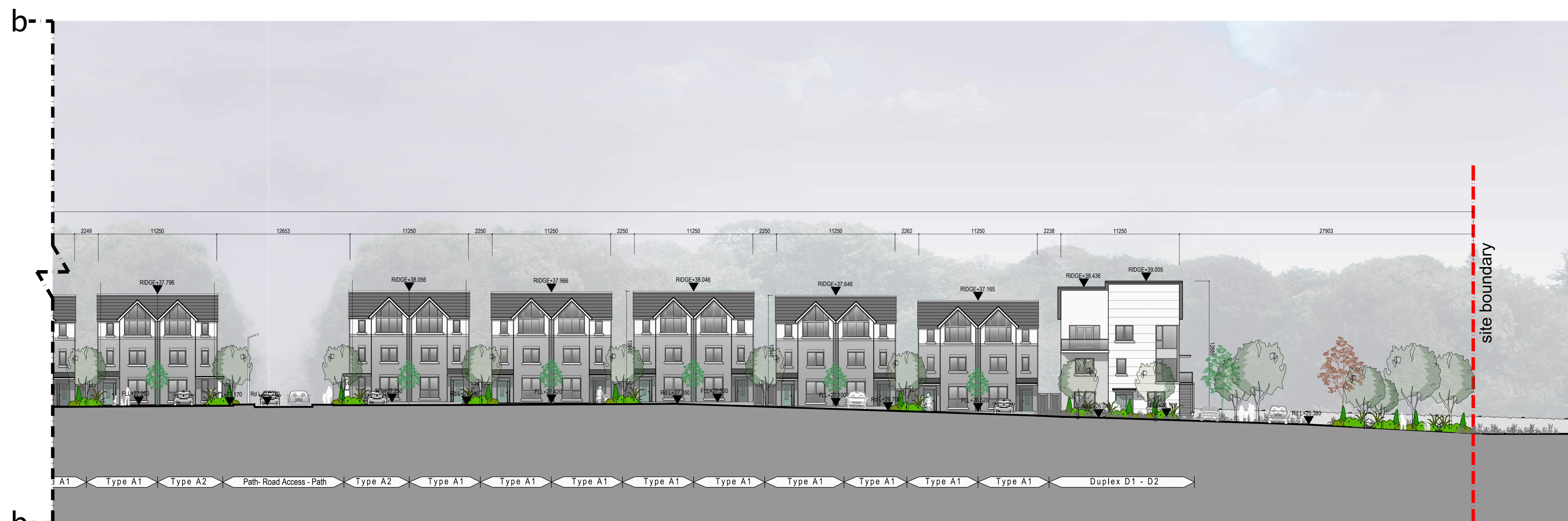
Context Elevation K-K (continued) Scale 1:200