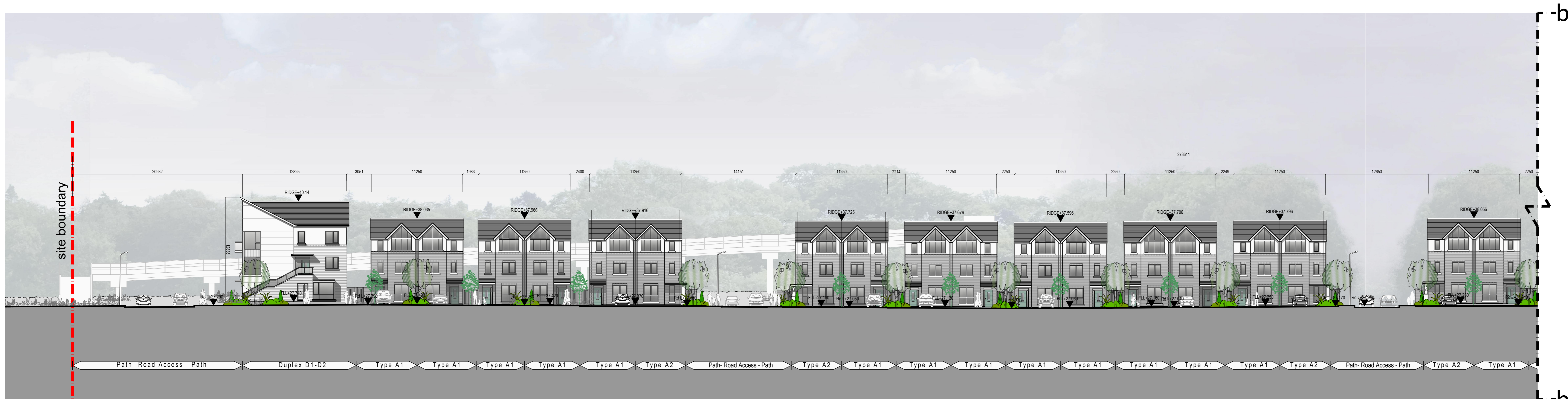
Context Elevation K-K Scale 1:200